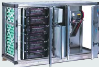
THE PURAFIL® SIDE ACCESS SYSTEM (PSA)

The FAS consists of modular frames that are individually tracked for Purafil media modules. Frames can be stacked to any size or configuration to meet any space requirement. The FAS is specified in retrofit applications with high airflows or for custom air handling units. Each frame with modules can handle airflows up to 2000 cfm depending on the model chosen.