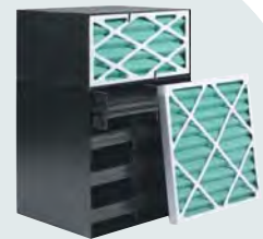
THE PURAFIL® FRONT ACCESS SYSTEM (FAS)

The PSA is designed for both particulate and general odor control and works in conjunction with the facility's air handling system. The PSA is a built-to-order system available in more than 20 size options. A full range of prefilter selections and particulate final filter selections are also available.